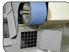
Hinged doors for increased suction