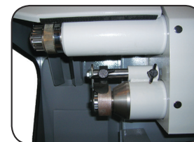
Adjustable sole trimmer SKU: MACKSA