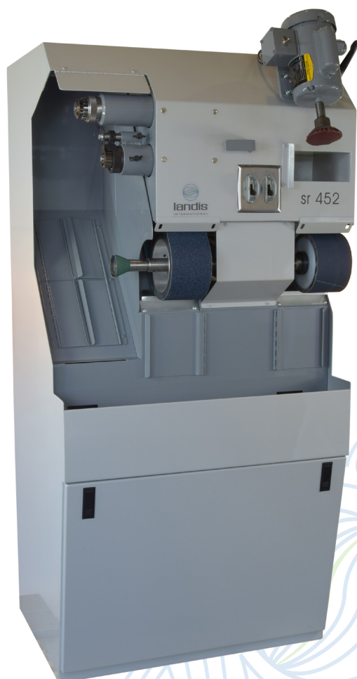
SR-452 Fully Equipped Model SKU:SR452

The SR-452 is the most economical basic finisher on the market. The SR-452 finisher is perfect for the single owner shoe repair shop. It accommodates all of the shoemaker's needs without cutting on performance as this high performance & quality finisher will provide you the efficiency you need and all of this at an affordable price.