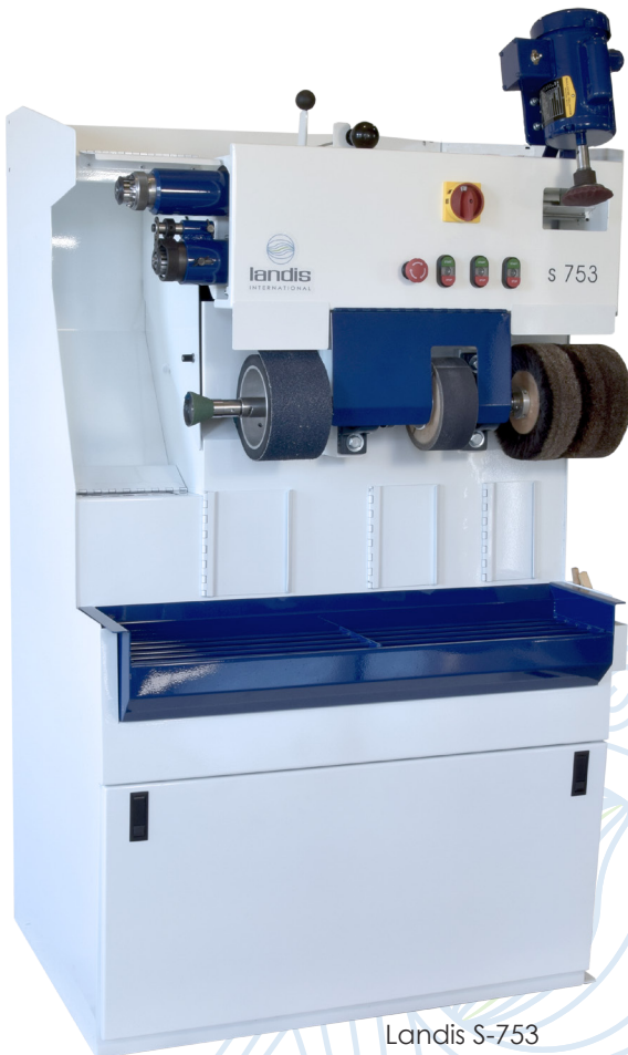
Landis S-753 SKU: LANDISS753

If space is a consideration, you no longer have to sacrifice quality and performance in a finisher. The S-753 accomplishes almost everything the larger machines do while occupying just a fraction of the floor space without compromising the high standards you've come to expect from Landis machinery. The S-753 is compact, highly efficient and versatile and is equipped with a powerful dust collection system.