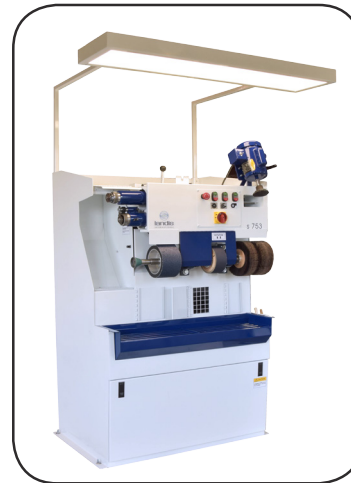
Led light system SKU: LEDSYSTEM

All Landis Finishers have a shaft bayonetted on both sides to interchange rapidly with our large variety of accessories