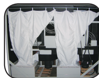
Double Blower Fan System

All Landis Finishers have a shaft bayonetted on both sides to interchange rapidly with our large variety of accessories.