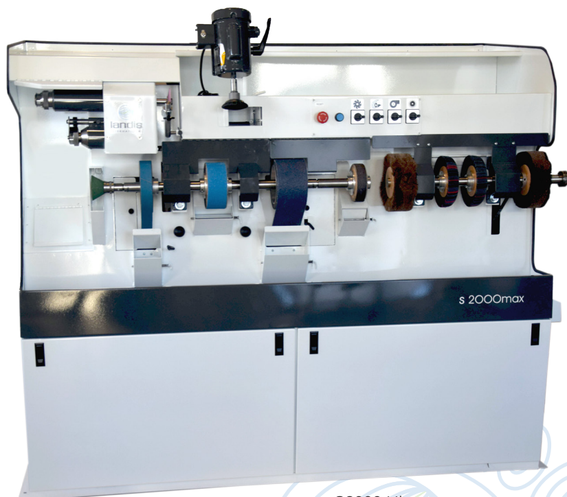
S2000 Ultra SKU: SUPREMES200UL

Accommodates Multiple Users in High-Volume Shops