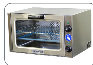
Available as an option Convection Oven IR1612 SKU: IR1612

The Work Stations can be customized to your specific needs!