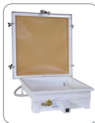
Include SVP DUAL 17" x 18"x 3" SKU: SVP1718