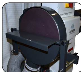
12" Sanding Disc SKU: DS12