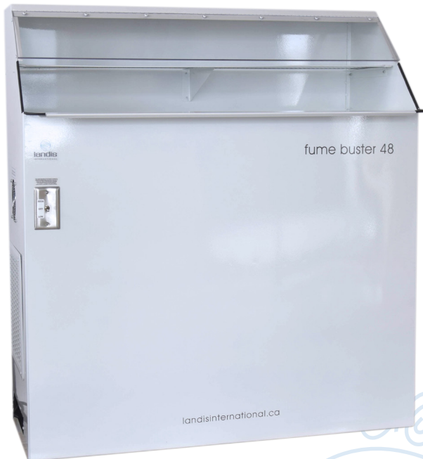
Fume Buster 4' (1219mm) SKU: FB48 914mm, 1219mm or 1524mm (3', 4', 5')

Create a Healthier Environment for Yourself and Everyone Around You