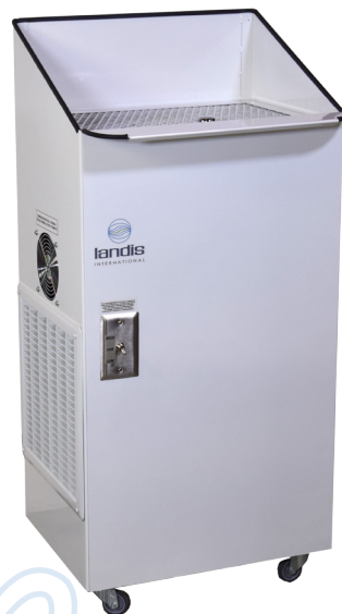
Fume Buster Space Saver SKU: FB19