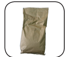
11.4Kg Replacement charcoal

The Fume Buster Series has been specifically designed to remove toxic air born chemicals and odors from your work environment.