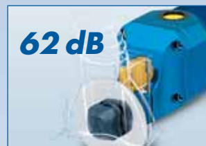
Very low noise level thanks to a patented anti-noise technology.