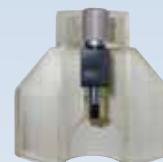
Vacuum nozzle Part #: T-CC-310-VN