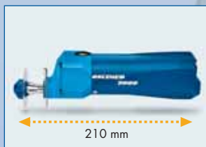
Usable with one hand thanks to its very short (8.25") and lightweight (1.6 lb) shape.